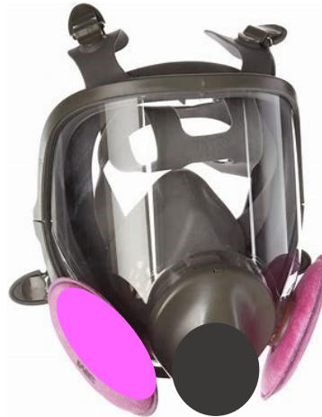
FIGURE 6: FULL FACE RESPIRATOR

Fit testing will be performed as required by Personal Protective Equipment, Respiratory Hazard section of the NS General Regulations and the referenced CSA Standard, CSA Standards CSA-Z94.4-18. ( Selection Use and Care of Respirators ) or the latest version of this standard.