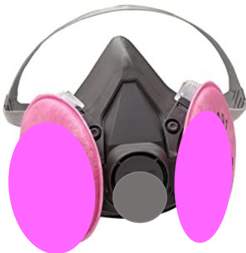
FIGURE 5: HALF FACE PIECE RESPIRATOR

This respirator provides more-than-required respiratory protection . They are reusable and require fit testing. These are tight fitting and the user must be trained by a competent person on how to use, maintain and clean the respirator as required by occupational health and safety, the manufacturer’s instructions for use and the governing CSA Standard (See Figure 5). This respirator should not divert from healthcare and is used very frequently in the construction industry.