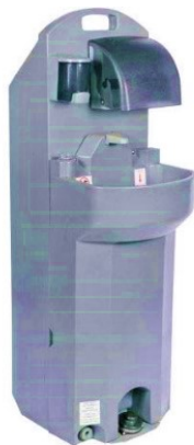
FIGURE 2: EXAMPLE OF PORTABLE SINGLE HAND HYGIENE BASIN