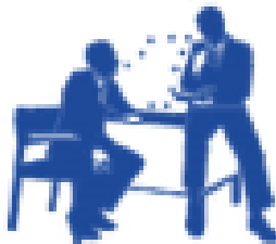
FIGURE 3: DROPLETS BEING SPREAD WITHIN A TWO METRE DISTANCE BETWEEN TWO PEOPLE

Job sites that are large enough may be able to easily accommodate the 2 metre separation requirement to continue to operate. If there are areas that cannot accommodate this, then other mechanisms need to be employed to get work completed.